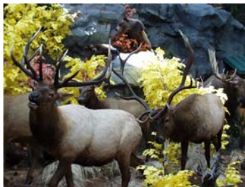
Cabelas Wildlife Display