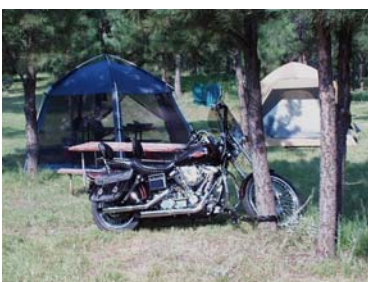
The Harley at Biker Camp

This summer we put the Harley on the trailer again and headed to Sturgis, SD for 2 weeks of camping and motorcycling. We found a great, relatively quiet campsite between Rapid City and Sturgis. We did lots of riding through Cus-